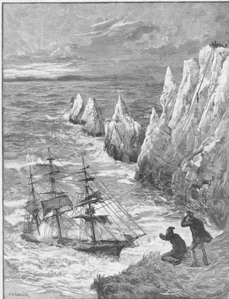
WRECK OF THE 'IREX' AT THE NEEDLES, ISLE OF WIGHT. REMAINS OF THE CREW.

WITH SIXPENCE EXTRA SUPPLEMENT 37 From 1890.